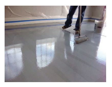
Dispersion Coat Pigmented