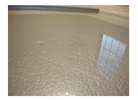
Finished Metallic Floor