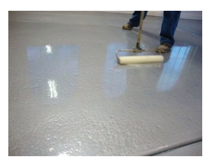
Clear Top Coat