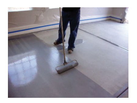
Primer Coat Pigmented